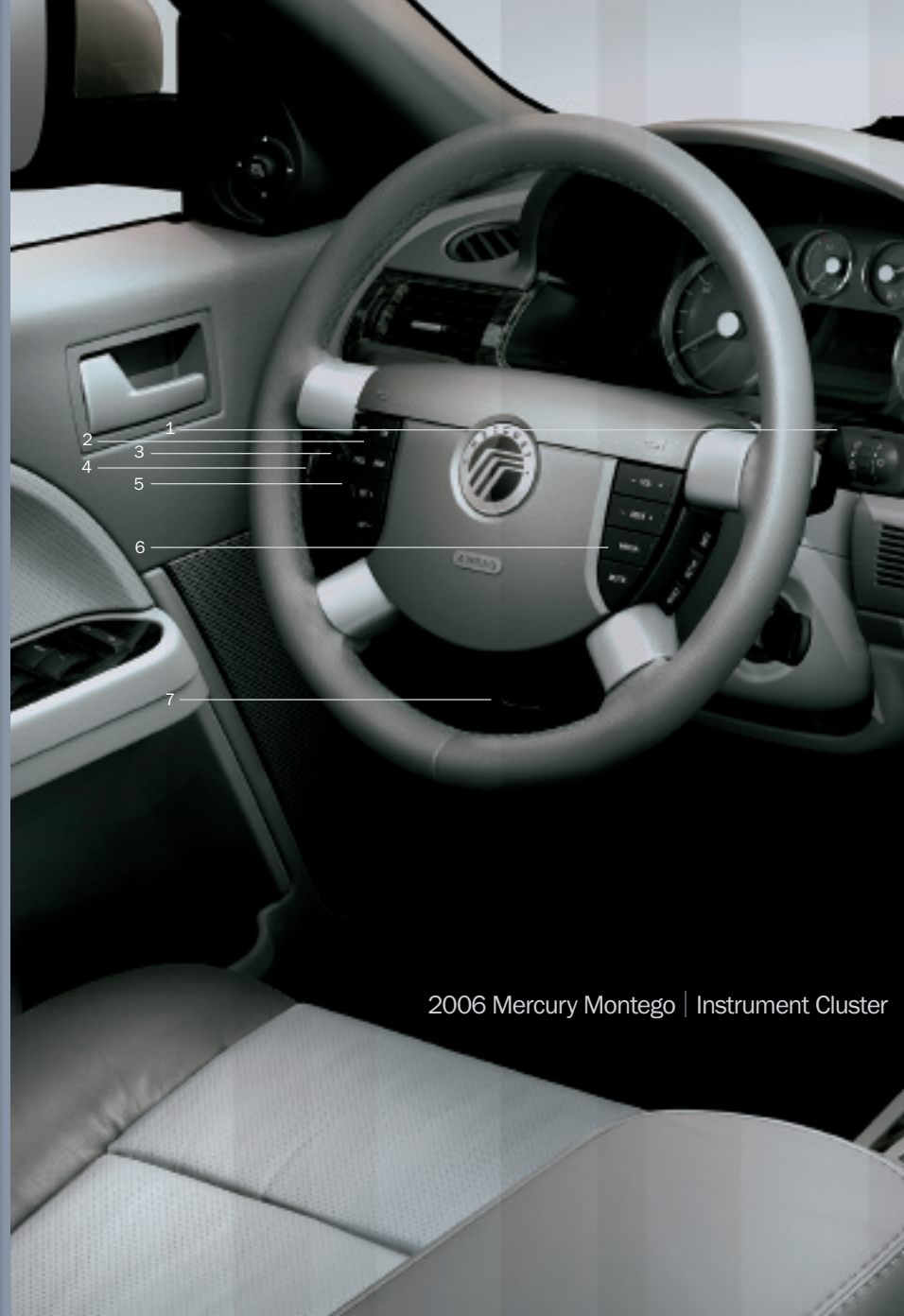
2006 Mercury Montego | Instrument Cluster