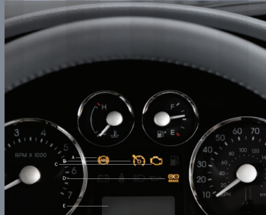
2006 Mercury Montego | Instrument Cluster