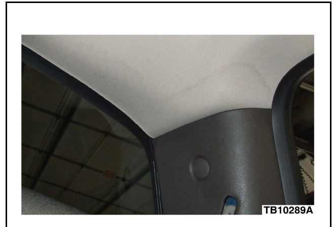
Figure 2 - Article 12-4-4