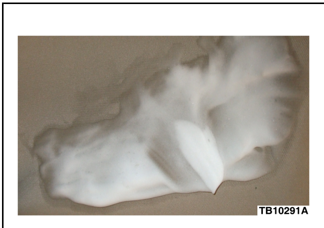
Figure 4 - Article 12-4-4