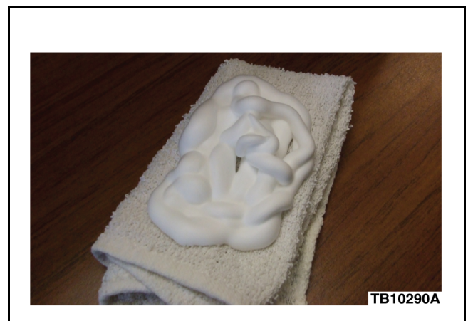
Figure 3 - Article 12-4-4

NOTE: The information in Technical Service Bulletins is intended for use by trained, professional technicians with the knowledge, tools, and equipment to do the job properly and safely. It informs these technicians of conditions that may occur on some vehicles, or provides information that could assist in proper vehicle service. The procedures should not be performed by "do-it-yourselfers". Do not assume that a condition described affects your car or truck. Contact a Ford or Lincoln dealership to determine whether the Bulletin applies to your vehicle. Warranty Policy and Extended Service Plan documentation determine Warranty and/or Extended Service Plan coverage unless stated otherwise in the TSB article. The information in this Technical Service Bulletin (TSB) was current at the time of printing. Ford Motor Company reserves the right to supersede this information with updates. The most recent information is available through Ford Motor Company's on-line technical resources.