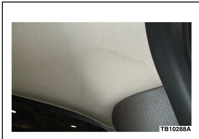
Figure 1 - Article 12-4-4