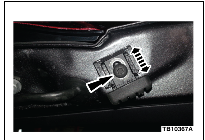
Figure 2 - Article 12-12-6