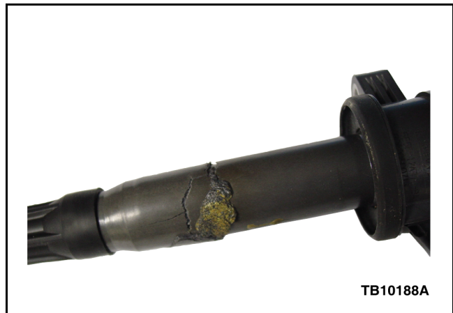
Figure 3 - Article 13-4-17