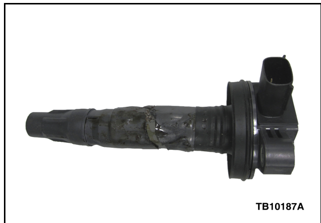
Figure 2 - Article 13-4-17