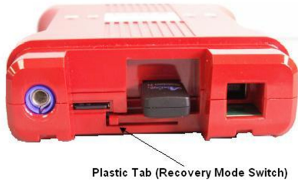
Figure 2: VCM II Rubber Boot Removed Exposing Recovery Mode Switch