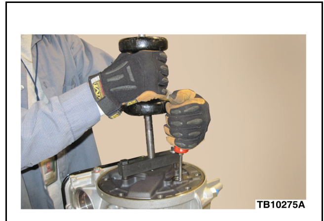
Figure 1 - Article 12-4-8